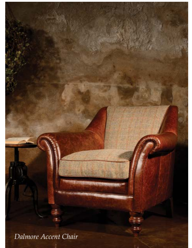
Dalmore Accent Chair